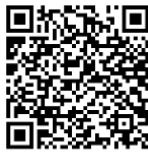
Arabic (Page 1)

The student guidebook provides basic information about the university which includes important contact info, departments in the university and some provided services. For more information, you can scan the following QR code below.